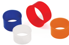
Translucent Decorative Collar