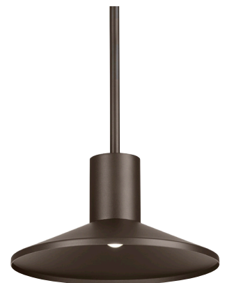
ASH PENDANT shown in bronze/clear lens