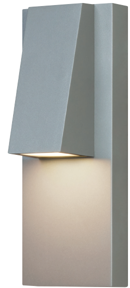
PEAK shown in silver