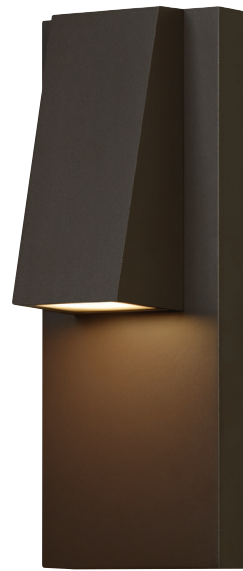
PEAK shown in bronze

* Visit techlighting.com for specific warranty limitations and details.