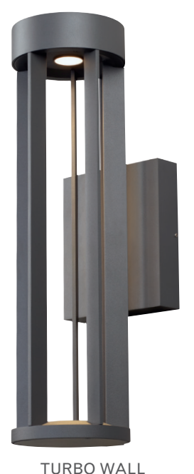
shown in charcoal