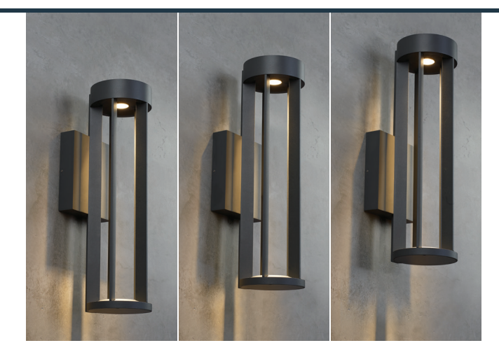
Integrated height adjustment system allows you to customize your fixture position. Low, Mid or High.